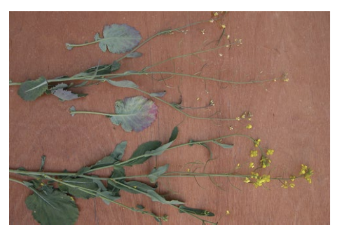
Photo 6–5. Sulphur deficiency, as seen in the canola plant on top, results in mottling of the leaf surface, purple underside of leaves and small, pale yellow flowers.

The current guideline is to apply up to 20 lb/acre of sulphur as an "insurance factor" against sulphur deficiency in canola. Applying 45 kg/ha (100 lb/acre) of ammonium sulphate (21-0-0-24) will supply the crop's sulphur needs and replace 23 kg/ha (50 lb/acre) of urea.