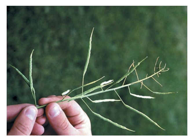
Photo 6–8. Heat blast. Hot temperatures during flowering (especially spring varieties) can cause heat blast and reduce seed yields.