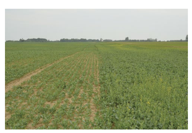
Photo 6–4. The impact of early canola growth is evident for this medium fertility field, where the crop on the left side had no starter fertilizer applied while the crop on the right side the crop received 55 kg/ha (50 lbs/acre) of MAP at planting.