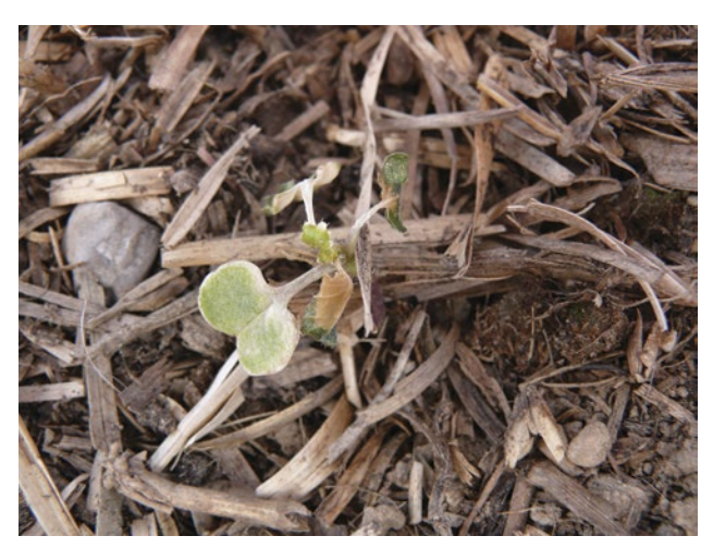
Photo 6–6. New growth from a canola seedling recovering from frost. Where the growing point is not damaged it will remain green.

Canola seedlings can recover from a light spring frost if the growing point is not damaged. Prior to taking any action, wait 4-5 days to assess damage. Check the growing point for green colour at the centre of the leaf rosettes. Although the cotyledons or other leaves may be black, re-growth can occur in 4-10 days depending on weather conditions if the growing point is alive. Photo 6-6 shows new growth from a seedling canola plant that has been affected by frost, but still has the growing point intact.