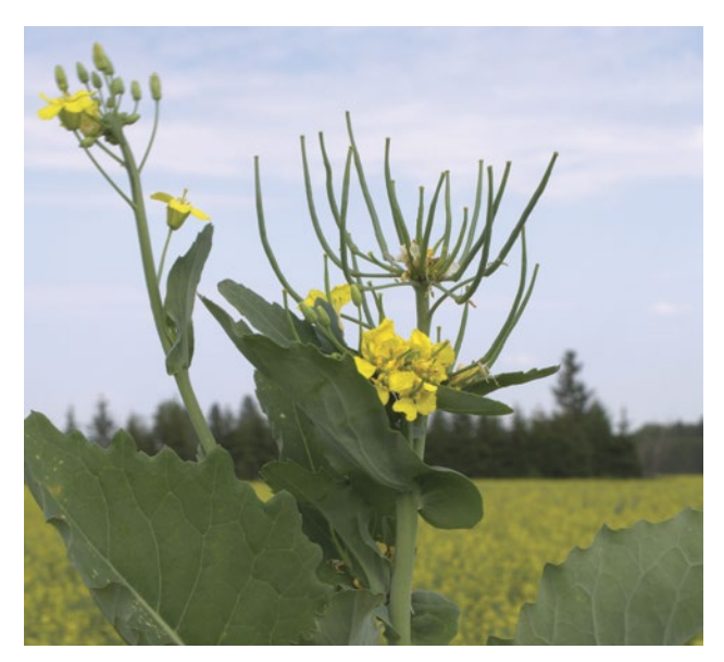
Photo 6–1. Swede midge in canola at bolting results in stunted and malformed plants.

Early April seeded canola has higher risk of mortality from seedling disease, soil crusting, and flea beetles. Early planted canola also has a higher risk of infestation by cabbage seedpod weevil during the flowering/early pod stage. Be prepared to control flea beetles if canola is slow to develop beyond the susceptible stage (i.e., up to 4 true leaves). Seed canola by early May to reduce the risk of damage by swede midge. Refer to Chapter 15, Insects and Pests of Field Crops for additional information on swede midge. Photo 6–1 shows the stunted and malformed canola plant resulting from swede midge infestation.