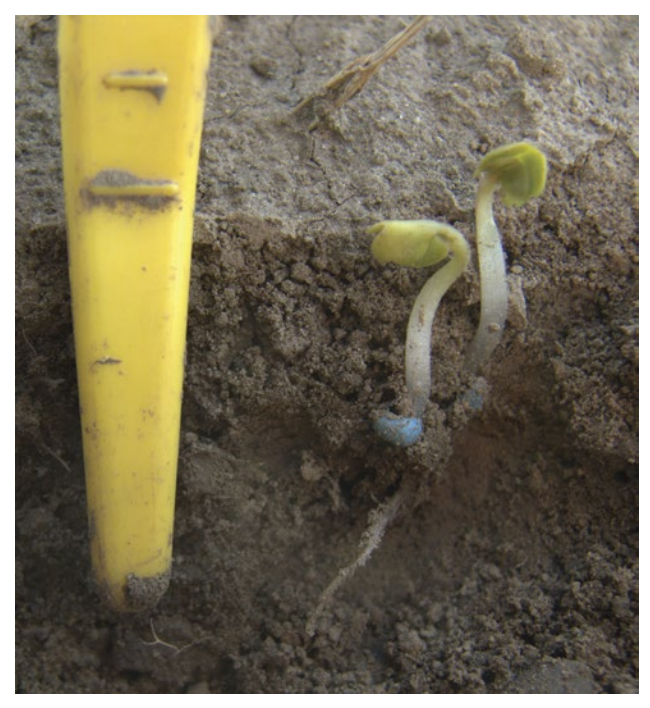
Photo 6–2. Canola seedling emerging from a 2.5 cm (1 in.) seeding depth.

the openers. Press wheels on the drill help place the seed uniformly at the bottom of the seed trench. Drill bounce is more of a problem at speeds over 8 km/h. If canola is seeded through the grass seed box, seed tubes should be directed behind openers and in front of the press wheels. Photo 6–2 shows canola emerging from 2.5 cm (1 in.) seeding depth.