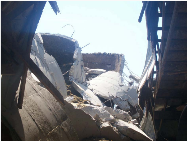
Figure 1. A collapsing silo can be lethal and cause significant damage when falling onto another structure.

The collapse of a tower silo can have serious consequences. In Ontario, farm owners and workers have died as a result of a silo collapse. The silos have fallen onto adjacent barns, injuring or killing animals, destroying property and ruining any silage or grain stored there. Figure 1 shows the impact a silo collapse can have on surrounding buildings.