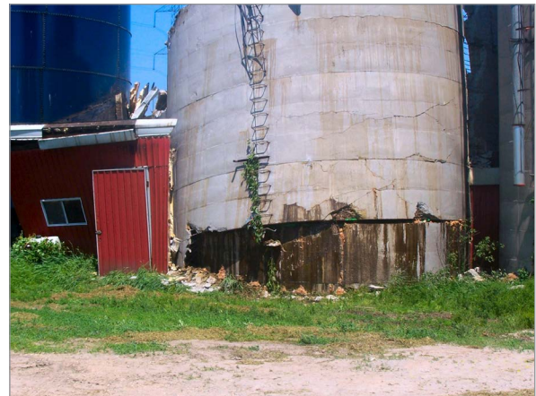
Figure 2. Filling a silo with haylage or corn silage that has higher than normal moisture content, will lead to seepage of corrosive liquids that weakens and damages a silo.

The same acids also corrode silo hoops, reinforcing steel or hardware associated with the silo. Without proper maintenance and repair, this can ultimately lead to silo failure. Figure 2 shows the effect of placing material in the silo that is too wet.