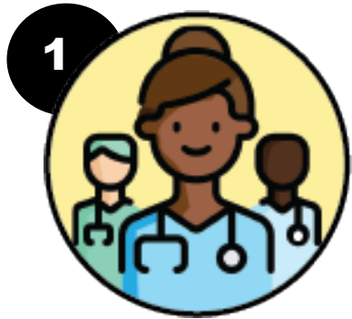
Step 1: Health Service Provider (HSP) adds Designee