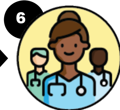
Step 6: HSP assigns permissions for Designee