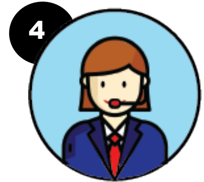
Step 4: Designee accepts designation using link from original email