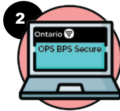
Step 2: OPS BPS Secure sends email to Designee containing link