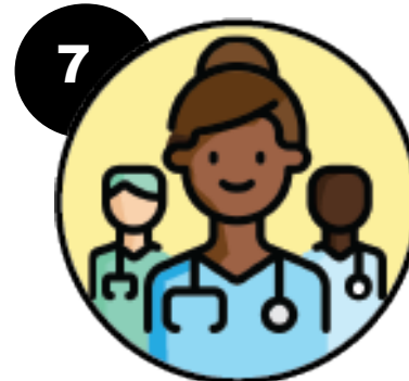
Step 7: HSP notifies Designee that permissions have been granted