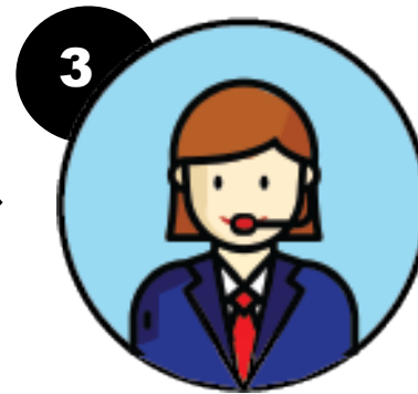
Step 3: Designee registers for OPS BPS Secure using link from email