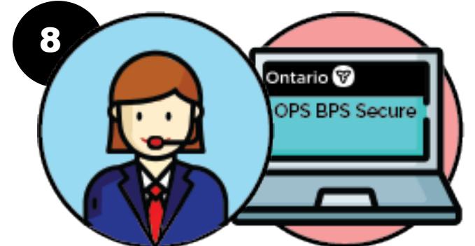
Step 8: Designee can now upload and download on behalf of HSP