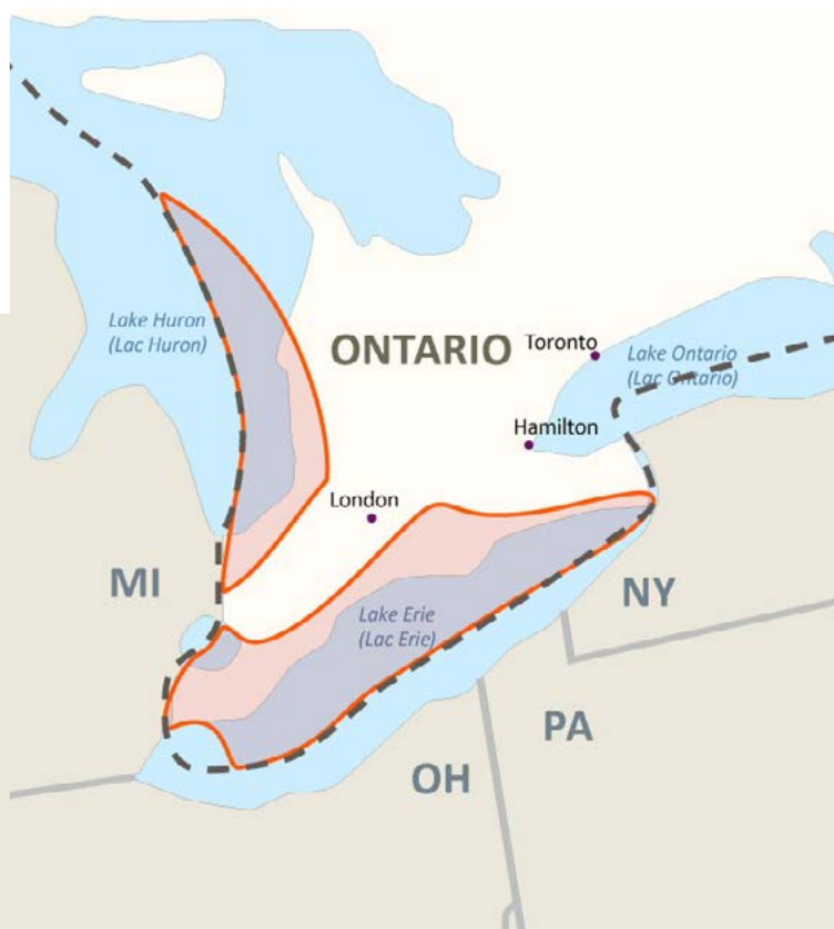
Figure 2: Map illustrating the suitable storage formations in southwestern Ontario for carbon storage.