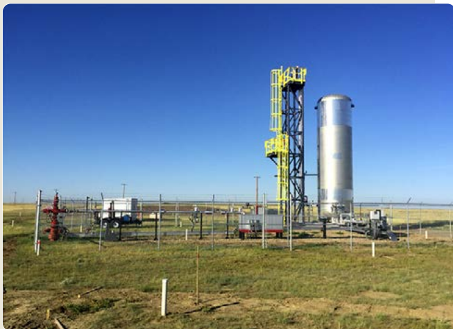
Figure 1: A carbon storage injection well in Alberta, Canada, courtesy of Carbon Management Canada.

According to the Global CCS Institute, the injection and storage of CO 2 "has been working safely and effectively for over 50 years" and "close to 300 million tonnes of CO 2 has been injected into storage formations underground." [1]