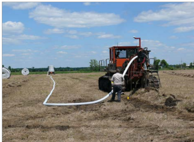
Figure 3. OMAFA's Drainage Inspector completing a Class "A" machine operator inspection.

An OMAFA Drainage Inspector completes the inspections required for the licensing of drainage machines, operators and businesses (Figure 3).