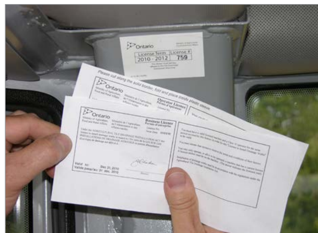
Figure 2. OMAFA licences issued to tile drainage contractors.