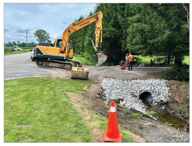
Figure 2. A drain maintenance project.

The bylaw that adopts the engineer's report establishes a right of access similar to an easement but is not registered on title. The municipality has the responsibility to maintain and repair the drains. The drainage superintendent and contractor authorized by the municipality may enter onto property to inspect the drain and complete any necessary work (Figure 2).