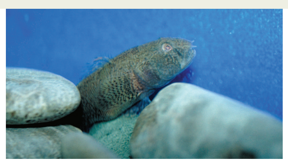
Tubenose goby.

Outside its native range, the tubenose goby is most abundant in the St. Clair River and Lake St. Clair. It is also found in Lake Erie, in Lake Superior at Thunder Bay, Ontario, and in Duluth Harbor, Minnesota. The fish has occasionally been sighted in the St. Lawrence River near Kingston, and in Lake Huron.