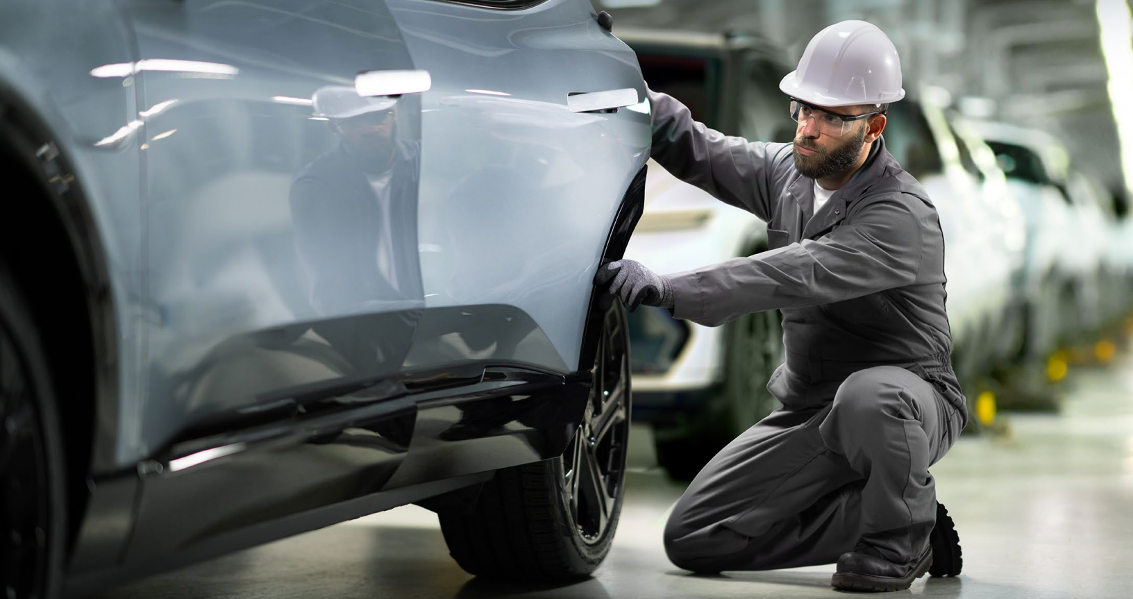
Above: Automobile assembly line in Ontario, Canada