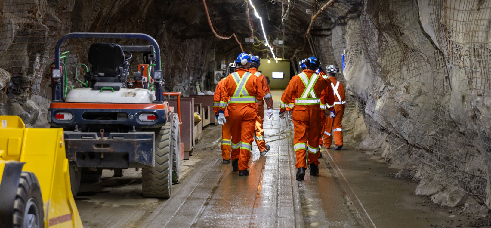
Above: A mine in Sudbury, Ontario