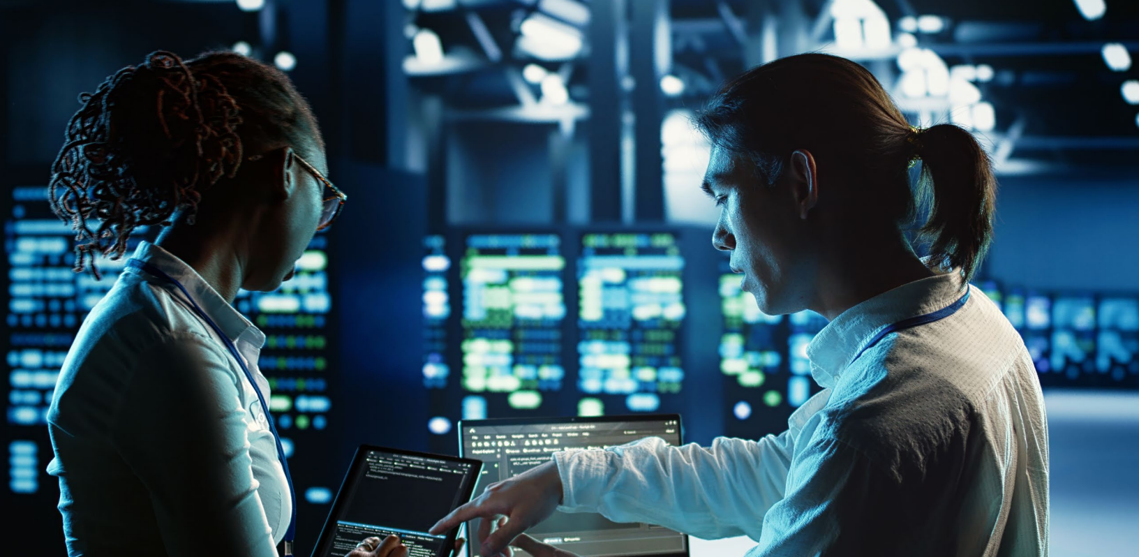
Above: Two computer engineers discuss cyber security in a server room