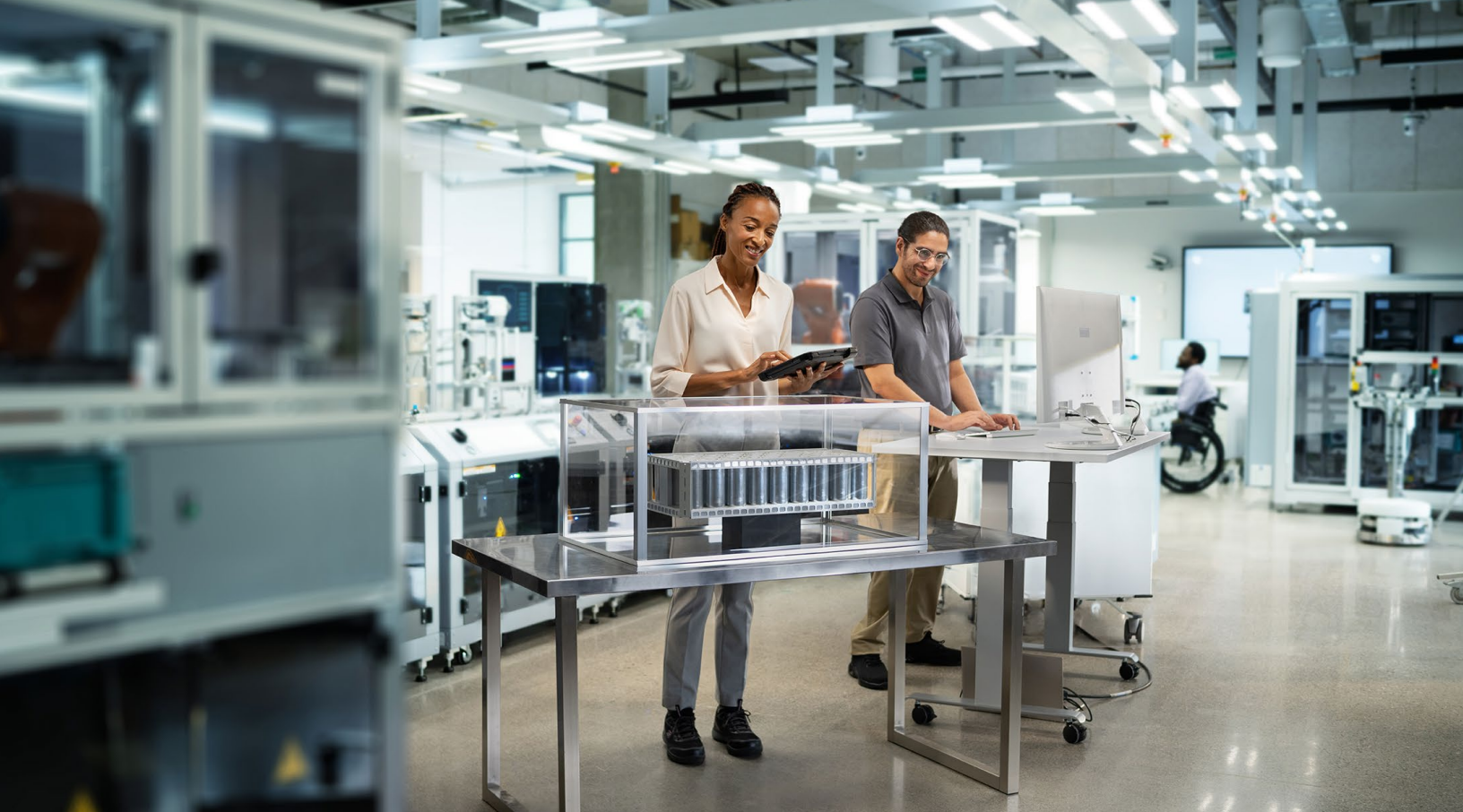
Above: Technicians in an EV research facility review a battery prototype